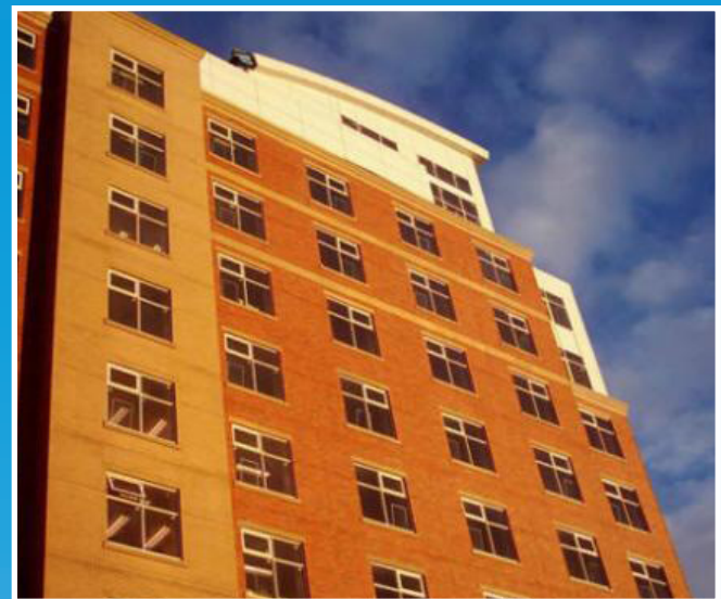
CFB Halifax Chief and Petty Officers' Accommodation (Halifax, Nova Scotia); LEED certified

CFB Shilo (Brandon, Manitoba) – To meet ambitious energy use reduction targets, Enermodal conducted energy analysis and recommended improvements to the design for several buildings on this campus.