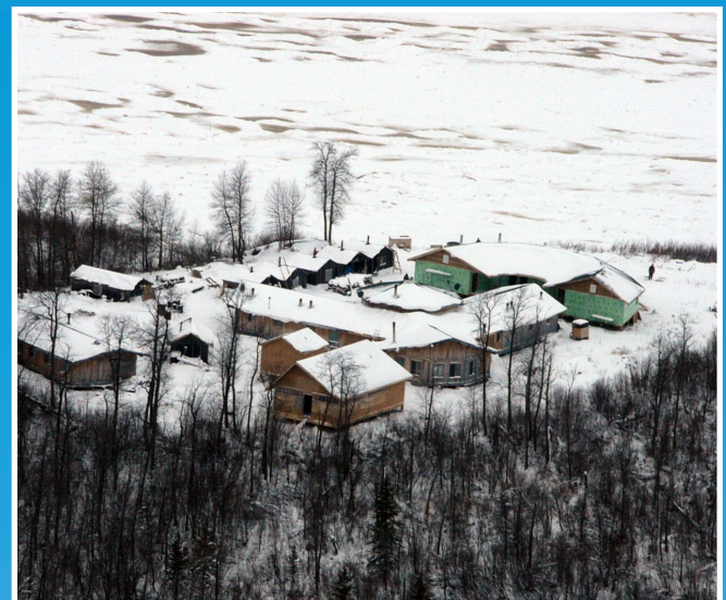
Washow Ecolodge, Moose Cree First Nations (Moose Factory, Ontario)

Washow Ecolodge (Moose Factory, Ontario) – This wilderness lodge includes a 3 kW PV electric supply. Also, potable water (treated with an ultra-filtration system) is supplied by a local creek. Wastewater is treated by composting toilets and biofiltration.