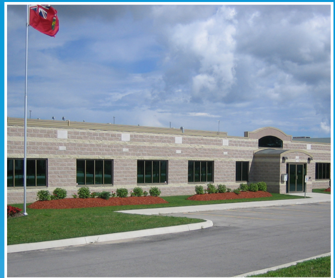
Aylmer Ministry of Natural Resources (Aylmer, Ontario) LEED Silver certified

Aylmer Ministry of Natural Resources (Aylmer, Ontario) – A LEED Silver certified office facility was the perfect fit for the ministry work in wise resource management. A rainwater cistern supplies water for toilet flushing, while waterless urinals provide additional water savings.