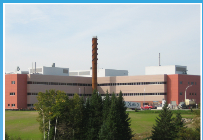
Upper River Valley Hospital (Waterville, New Brunswick); LEED Silver certified