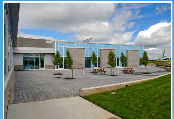
Walkerton Clean Water Centre (Walkerton, Ontario); LEED Gold candidate