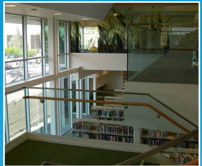
Montrose Cultural Centre (Grande Prairie, Alberta) LEED Silver candidate

Montrose Cultural Centre (Grande Prairie, Alberta) – This LEED Silver candidate art gallery and cultural centre includes ventilation heat recovery and automated lighting.